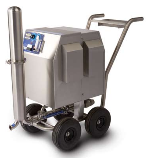
Model: PC 16 Portable Ozone Contacting System

Ozone's revolutionary air-cooled corona discharge ozone technology in compact and completely integrated ozone contacting systems. These durable, mobile units provide ozone production comparable to that of permanently installed ozone contacting skids – up to 25 grams per hour or 1.3 pounds per day.